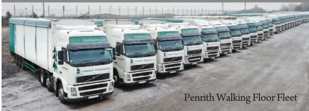
Penrith Walking Floor Fleet