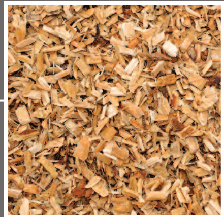
Woodchip for paper, panelboard, biomass, landscaping and amenity.