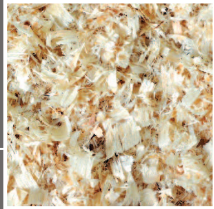
Wood shavings for equestrian, poultry and livestock.