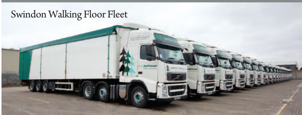
Swindon Walking Floor Fleet