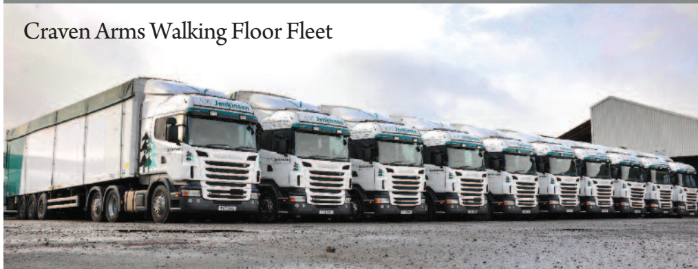
Craven Arms Walking Floor Fleet