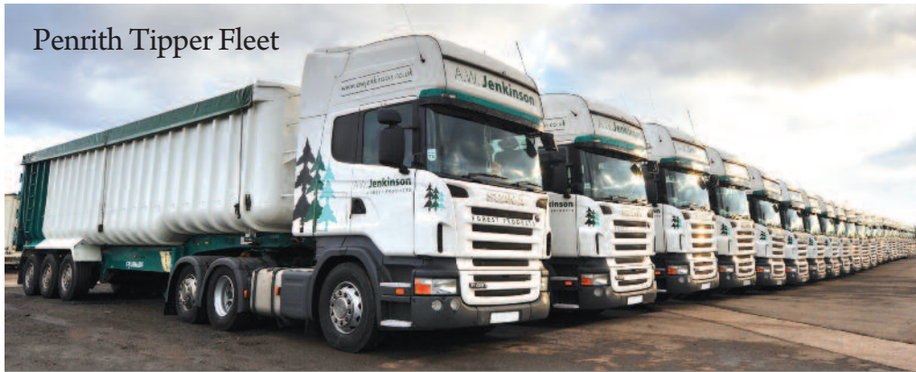
Penrith Tipper Fleet