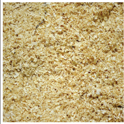
Sawdust for animal bedding, panelboard and biomass.