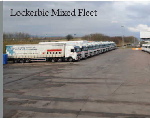
Lockerbie Mixed Fleet