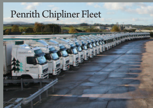
Penrith Chipliner Fleet