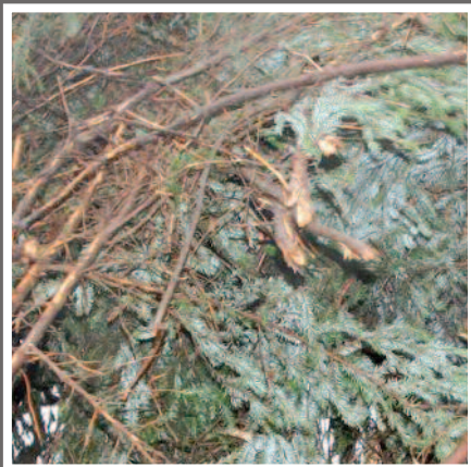
Branches, topwood and stumps recovered for biomass.

Hardwood or Softwood, any species, all qualities; A.W. Jenkinson Forest Products make use of every part of the tree. Green material can go to compost; roundwood to woodchip and shavings; stump material, branches and twigs to biomass; slabwood, offcuts and trimmings to panel board; and bark to horticulture and amenity uses.