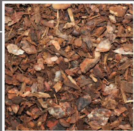
Bark for landscaping, amenity, horticulture and other specialist applications.