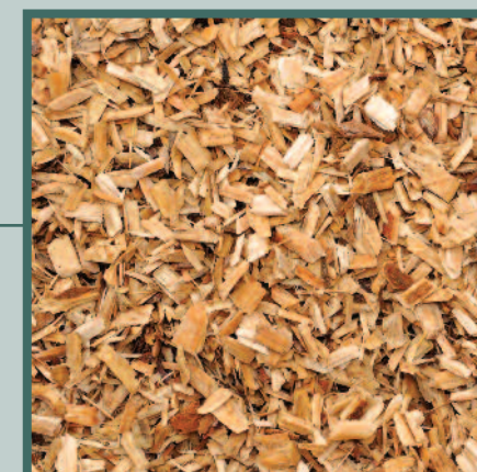
Woodchip for paper, panelboard, biomass, landscaping and amenity.