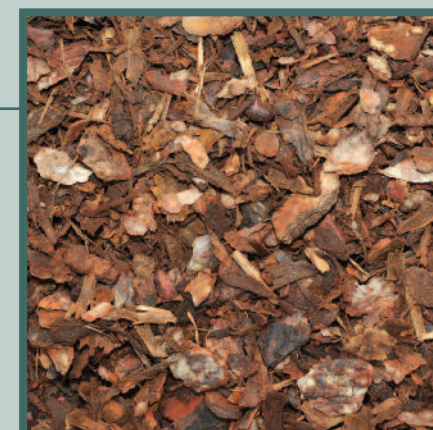
Bark for landscaping, amenity, horticulture and other specialist applications.