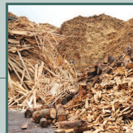
Slabwood and offcuts, converted to woodfibre for panelboard and biomass.