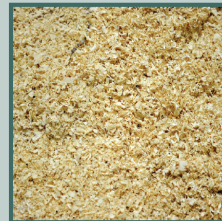
Sawdust for animal bedding, panelboard and biomass.