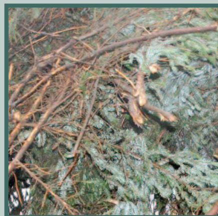
Branches, topwood and stumps recovered for biomass.

Hardwood or softwood, any species, all qualities; the A.W. Jenkinson group makes use of every part of the tree. Green material can go to compost; roundwood to woodchip and shavings; stump material, branches and twigs to biomass; slabwood, offcuts and trimmings to panelboard; and bark to horticulture and amenity uses.