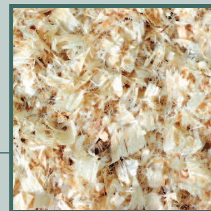
Wood shavings for equestrian, poultry and livestock.